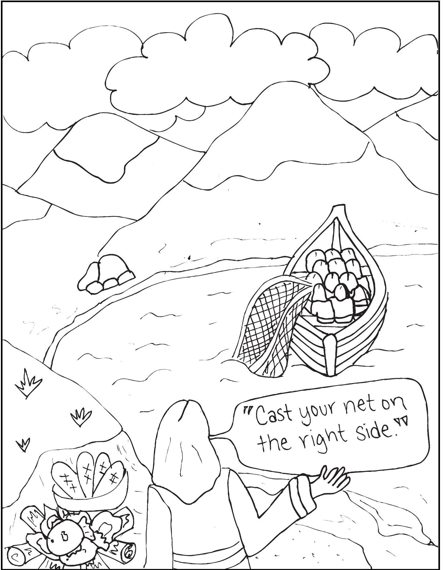
Jesus and his disciples